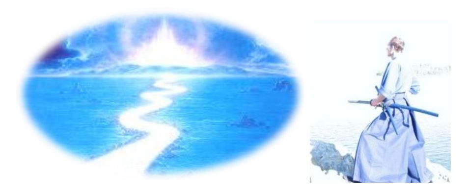
"The journey of a thousand miles begins with the first step"